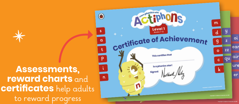
Assessments, reward charts and certificates help adults to reward progress