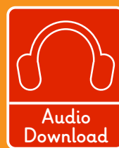
An exclusive audiobook and song for each of the stories