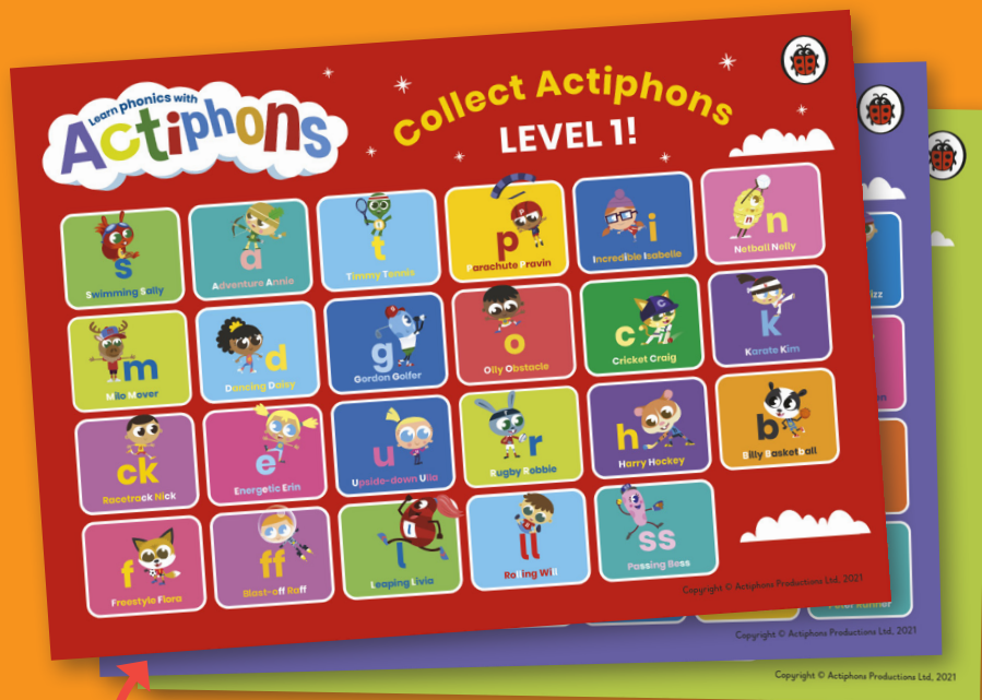
Fun posters show the letters and characters in each level