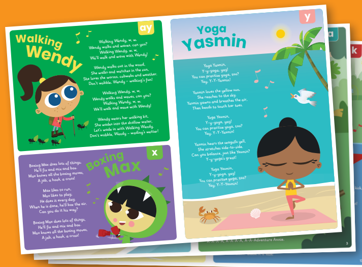
Songbooks in every level provide the lyrics for singing along